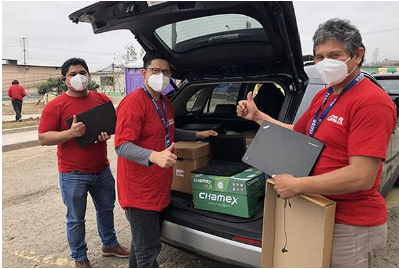
Fluor volunteers deliver laptops and help create a small computer lab at a school in Lima, Peru.