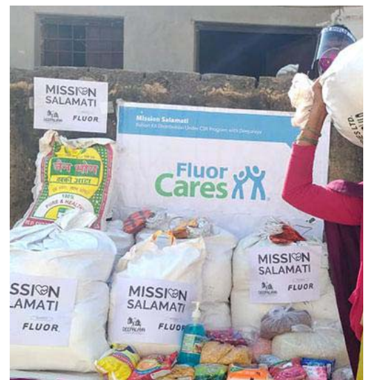
Fluor's New Delhi office distributed 3,000 Ration Kits to families impacted by COVID-19. Each Ration Kit provides food for one month. The 3,000 kits provided a total of 800,000 meals to families in villages near Fluor's office.

This effort was coordinated in close partnership with village leaders and municipal council members. Following strict HSE guidelines and with minimal employee volunteer participation, the dry ration and sanitation kits containing reusable cloth masks and enough food for a family of four for one month were distributed to 3,000 families in local villages near Fluor's office.