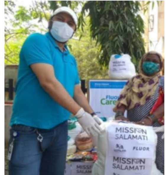
Fluor volunteers in New Delhi distribute meal kits

Each ration kit serves a family of four enough food for one month. Eight Fluor volunteers donated 87 hours to safely distribute the ration kits to day laborers and construction workers in Gurgaon, just southwest of New Delhi.