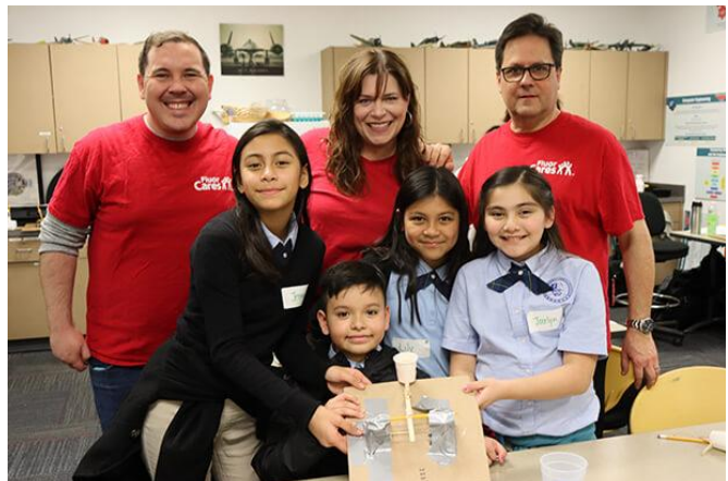
Fluor volunteers work with students on the 2020 Fluor Engineering Challenge (Dallas).

Many utilized the Fluor Engineering Challenge in classrooms and after school programs. Volunteers from 22 Fluor locations visited 87 schools and youth-serving organizations, providing 9,623 students with 16,626 hours of STEM enrichment. Fluor employees – 629 of them – volunteered a total of 5,830 hours of their time to support Engineers Week outreach activities.