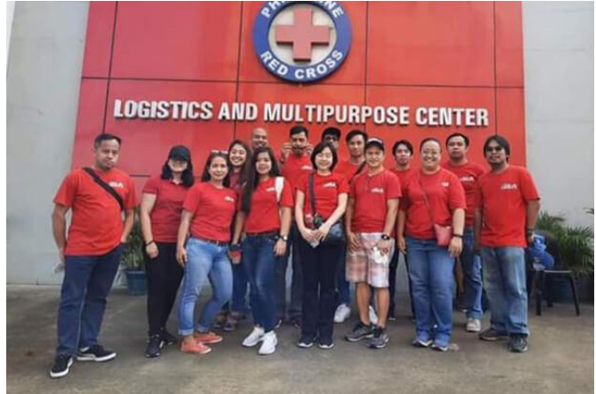
Fluor volunteers pack relief goods at Red Cross warehouse (Philippines).

As Fluor works to provide solutions for clients and help its personnel resolve local issues, it has empowered its Community Relations teams around the globe to redirect existing financial resources to the most meaningful COVID-19 relief efforts in their local communities. Within a matter of days, these teams found ways to redirect more than US$600,000 – so far – in the form of supporting meal service charities and other critical human needs, contributing to local COVID-19 relief funds organized by trusted community partners, and reserving resources to help schools rebound once buildings re-open.